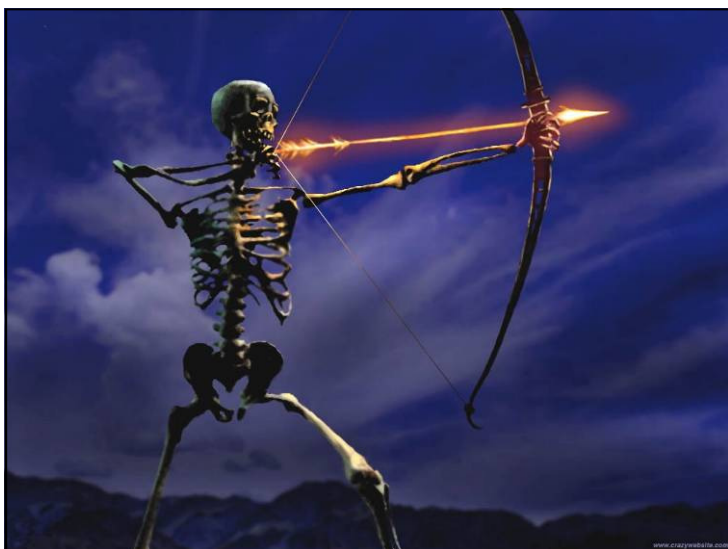
FOUND ON THE WEB!!!

KAA Has purchased a full set of four of the Chronotir lights plus control for use by KAA clubs as well as at our own WA events. Any club wishing to hire them is asked to contact the KAA treasurer or Equipment officer via the KAA website. These are not cheap items so a deposit / letter of guarantee will be required!